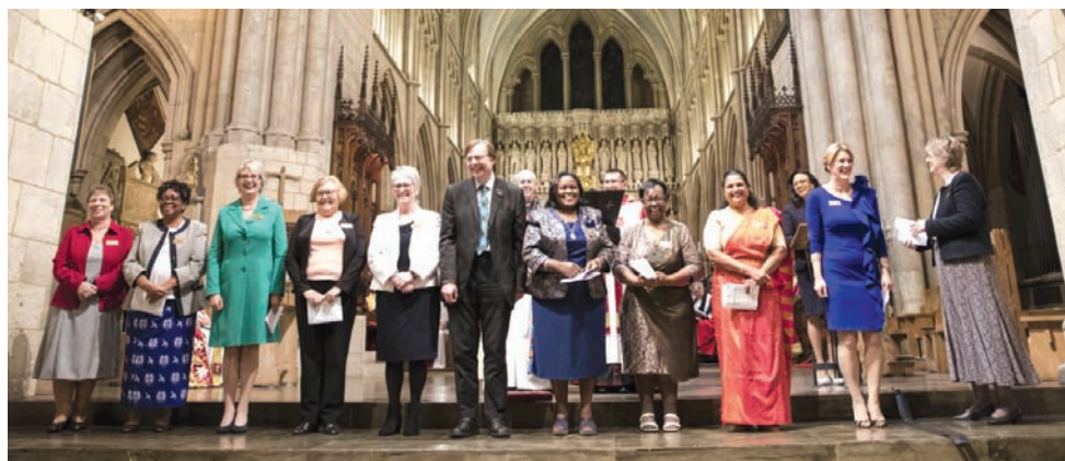
Above: The commissioning of the World wide Trustees of the Mothers' Union at Southwark Cathedral in February 2019