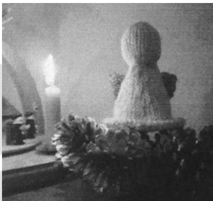
This angel is knitted in sparkly cream, with sparkly mohair wings