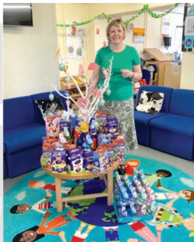
A Mothers' Union member giving Easter eggs to the children of the young offenders.